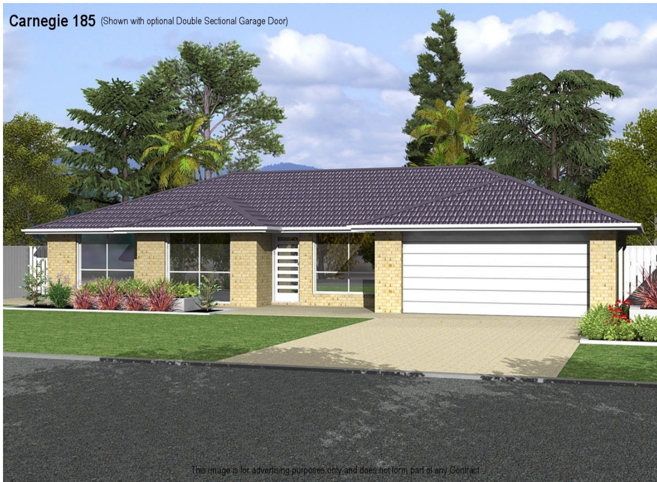
Carnegie 185 (Shown with optional Double Sectional Garage Door)