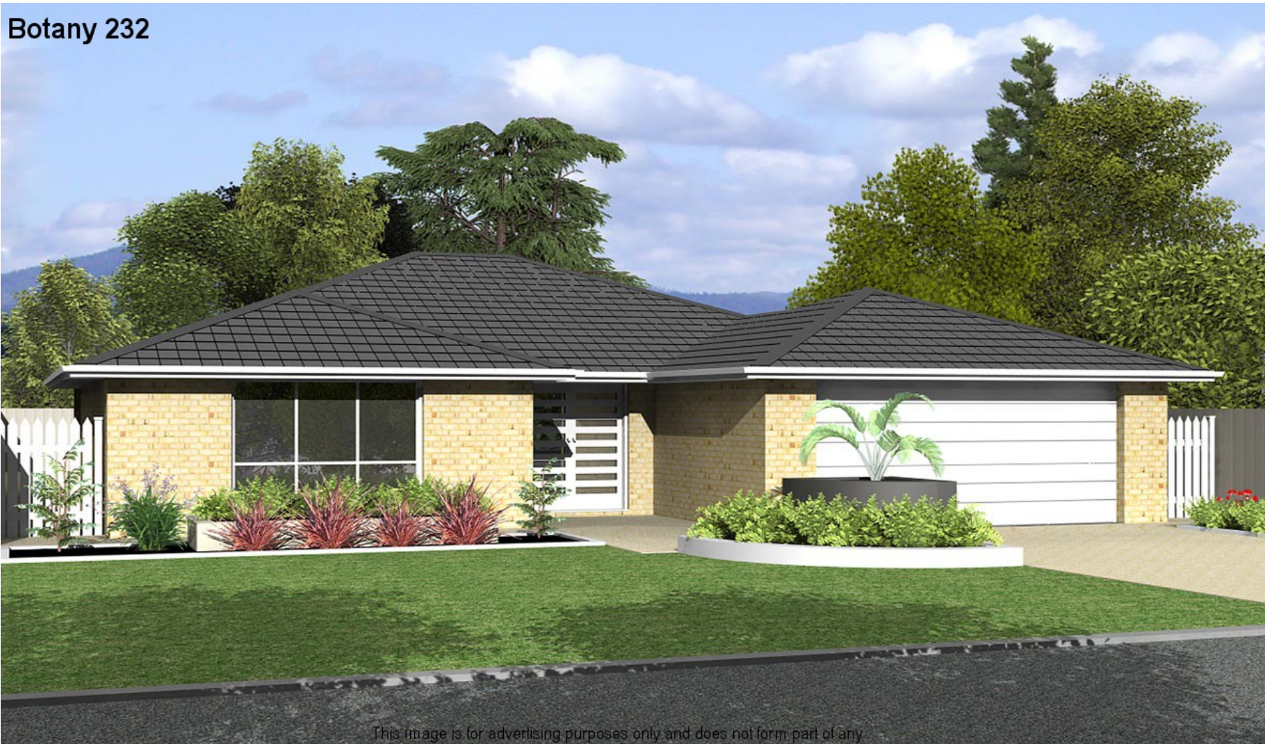
This image is for advertising purposes only and does not form part of any